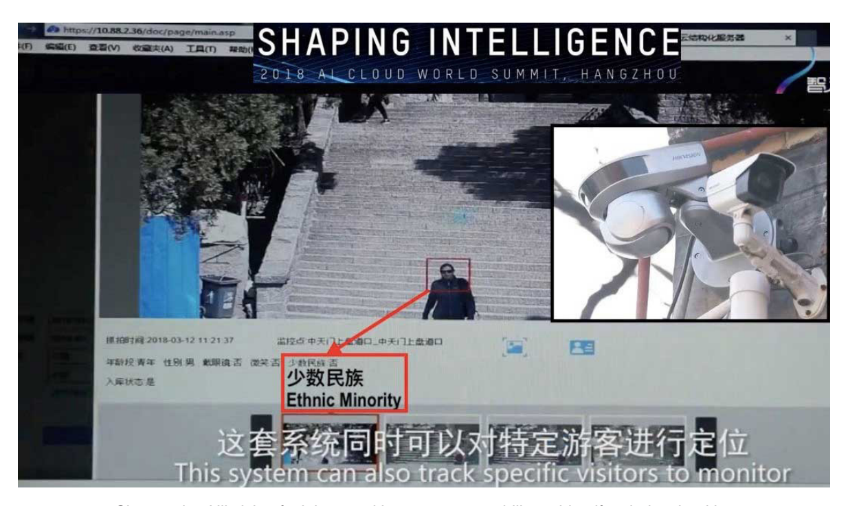
Showcasing Hikvision facial recognition camera capability to identify ethnic minorities.

The active presence of police forces the monastics to constantly ask themselves whether anything they do could be considered illegal. Because China's laws are chronically vague, it is hard to know when one has crossed the line, until it's too late. The prevalence of prosecutions for the crime of "picking quarrels and provoking trouble" is high, and many Tibetans have been declared guilty for expressing dissent from the official line.