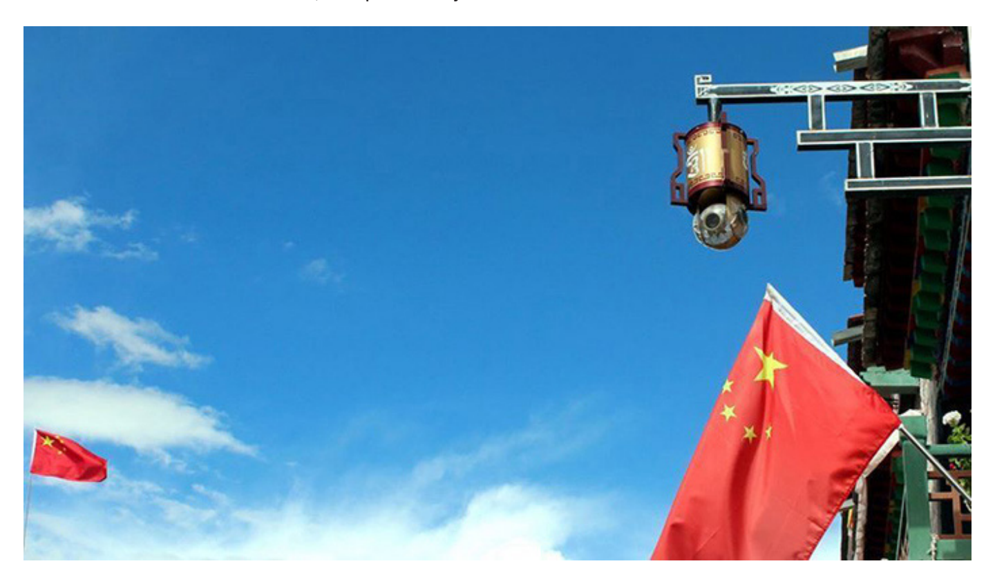
A surveillance camera in Lhasa disguised as a prayer wheel.