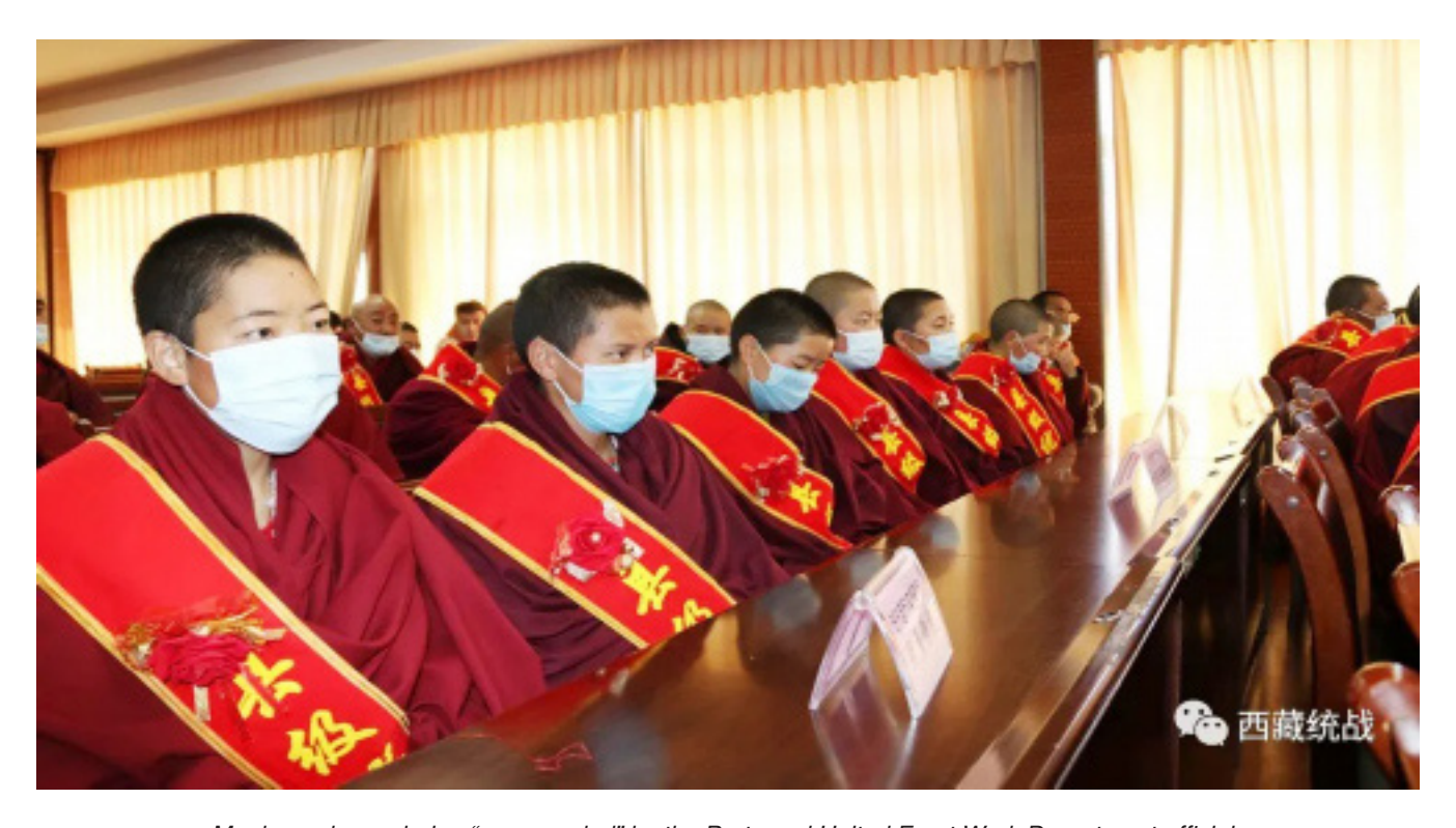
Monks and nuns being "commended" by the Party and United Front Work Department officials in January 2021 in Chonggye (Qiongjie) County, Lhokha (Shannan) City for "complying with four standards and striving to be advanced monks and nuns".

For the achievement of the objective of "long term stability," controlling the monastic community's loyalty to the party and the denunciation of the Dalai Lama—a policy adopted at the 1994 Third Tibet Work Forum—continued to be implemented in 2020. During a video conference for the development of "education activities" on "Complying with the Four Standards to be Advanced Monks and Nuns" in April 2020, Liu Zhiqiang, deputy secretary of the party committee in Lhoka (Ch: Shannan) City, ordered a "focus on dealing with the major political struggles of the 14th Dalai Lama's death and reincarnation" for stability maintenance.