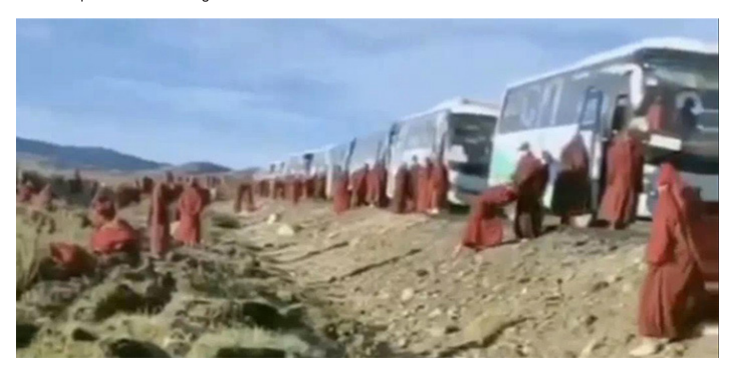
Nuns forced to leave Yachen Gar.

Similarly, over 6,000 monastics were expelled from Yachen Gar Buddhist Institute in early 2019. Any hope of joining monasteries in the Tibet Autonomous Region stood no chance in the face of administrative measures explicitly restricting monks and nuns from traveling freely in pursuit of knowledge.