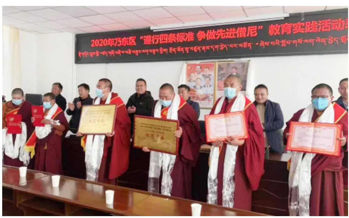
The Party and United Front Work Department hold a work summary and "commendation" ceremony on Jan. 19, 2021, for the conduct of "Complying with the Four Standards for Monks and Nuns" in Nedong (Naidong) District in Lhoka (Shannan).

In September 2014, Xi Jinping's speech at the 65th anniversary of the founding of the Chinese People's Political Consultative Conference revealed his vision for the UFWD's role. Xi said, "The United Front is the victory of the Communist Party of China in the cause of revolution, construction, and reform. It is an important magic weapon to realize the great rejuvenation of the Chinese nation." In order to strengthen the party's power over the state organs responsible for religious affairs, a series of bureaucratic reorganizations were made to bring religious affairs under the CCP's "magic weapon" mass organ—the United Front Work Department. The UFWD reports directly to the Central Committee of the Communist