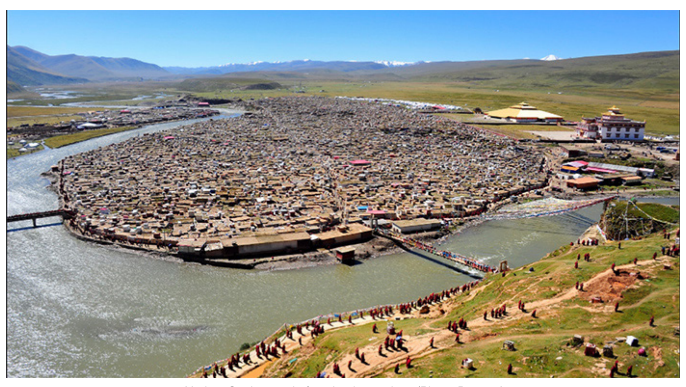
Yachen Gar in 2013 before the destruction.