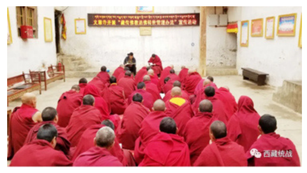
A cadre instructing monks at Yizhang Monastery to abide by the law on reincarnation.

The so-called management committees came into existence starting in 2011 after the government scrapped the nominal autonomy—first introduced in 1962 and reinstated in 1980 after the Cultural Revolution— in monasteries for direct rule. According to Human Rights Watch, the decision to impose direct rule came in the wake of a research project initiated by the United Front Work Department following the popular protests in Tibet in 2008. The purpose of that report was to identify who was to be blamed for Tibetan protests. Unlike the government maintaining indirect rule through the "Democratic Management Committee" in monasteries of elected monks and nuns approved by members of their monastery or nunnery, the Management Committees are installed directly by the government for "political stability" and to "establish harmonious monasteries."