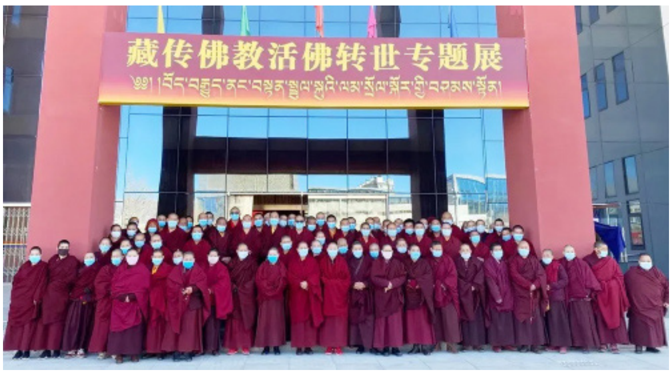
Propaganda exhibition in Lhasa for 100 monks and nuns from Chushur (Qushui) County undergoing "Complying with Four Standards for Monks and Nuns." The exhibition projects Tibetan reincarnation system as being managed by the central government of China between Yuan through Qing dynasties.