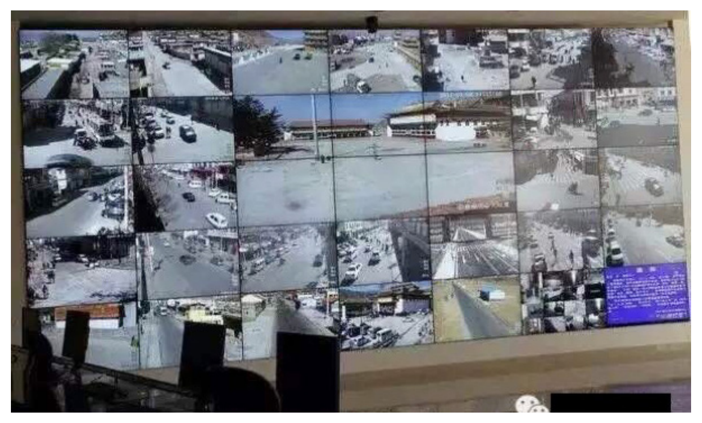
Surveillance cameras control room at Kirti Monastery in Ngaba (Aba), Sichuan.

Despite over 60 years of its direct rule, the Chinese Communist Party has not been able to secure the support of the people in Tibet. Decades of oppression have not enabled the CCP to establish the legitimacy of its rule in Tibet with sustained resistance by Tibetans. Apparently in fear of not being able to consolidate its legitimacy in Tibet, and indicative of the insecurity of its rule, the party ever more fiercely uses harsh rhetoric and introduces far-reaching laws and regulations in Tibet. Securitization has expanded to cover almost all aspects of life.