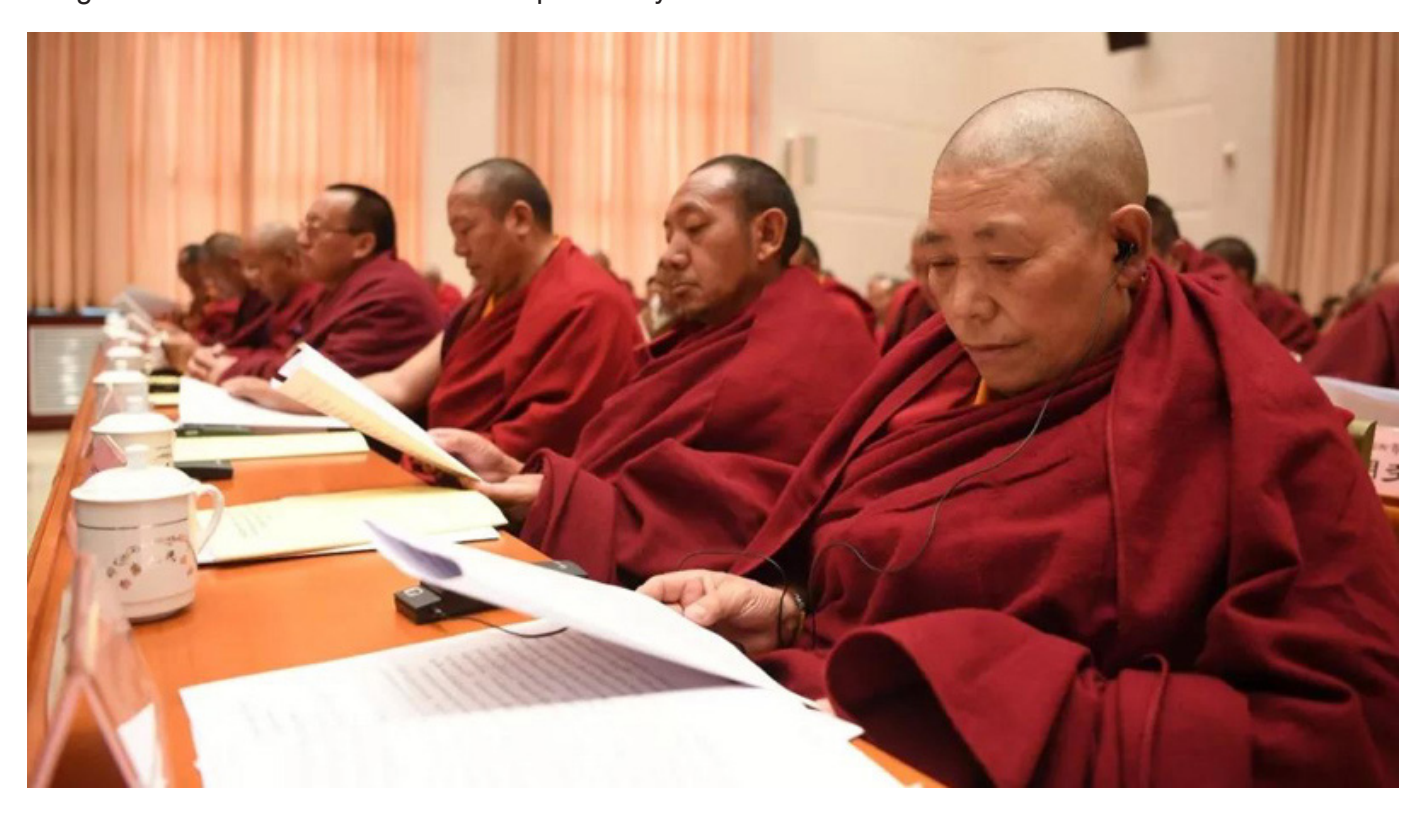
Monks and nuns at the symposium on the "four standards" read handouts issued by Chinese officials.

Although the UFWD always played an important role in Tibet policy in the past, especially since the establishment of its seventh bureau dealing with Tibetan affairs in 2005, this structural change gave an arm of the CCP even more power and significance in overseeing the implementation of the policies in Tibet and in particular controlling the monastic community. This is also confirmed by the tripling of the budget for the UFWD in the TAR in the past five years.