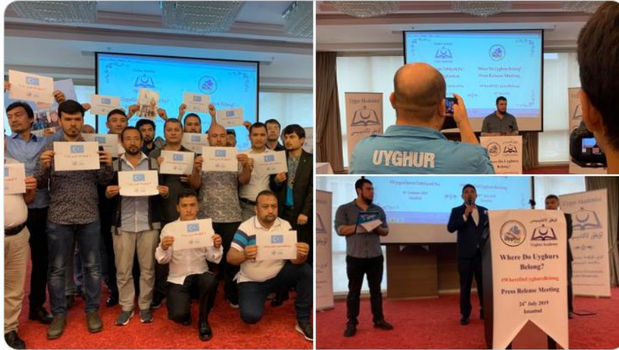
Uyghur Aid and Uyghur Academy press conference in Istanbul to launch the #WhereDoUyghursBelong hashtag, July 24, 2019. 13

Stateless Uyghurs say they feel trapped in the system without passports and worried they could be sent back. #WhereDoUyghursBelong is a new campaign by @HalmuratU to bring attention to their plight and pressure countries to help.